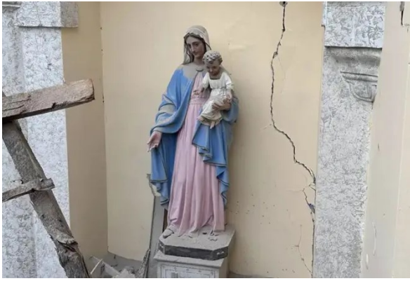
Image of the Virgin Mary in the rubble of the Cathedral of Alexandria in Turkey, Feb. 6, 2023.